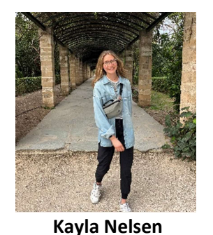
Head Server/Media Intern Carmel, IN Michigan State University (Journalism, Environmental Studies & Sustainability)