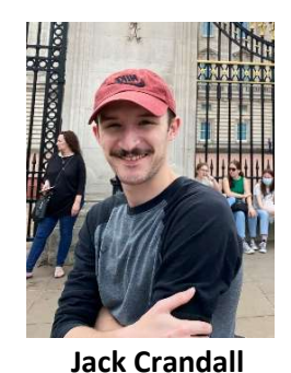
Program Lake Orion, MI Currently Optical Engineer at K-Space Associates