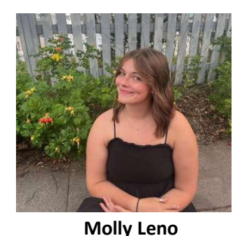
Head Housekeeper/Archives Arlington Heights, IL Univesity of Illinois (Kinesiology & Physical Education)