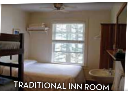
TRADITIONAL INN ROOM