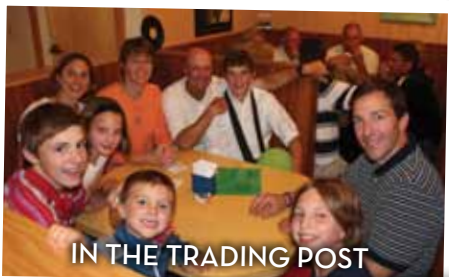
IN THE TRADING POST