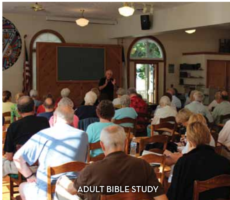
ADULT BIBLE STUDY