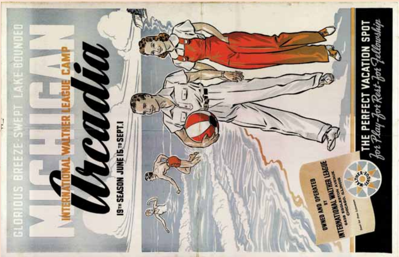
CAMP POSTER SUMMER 1941